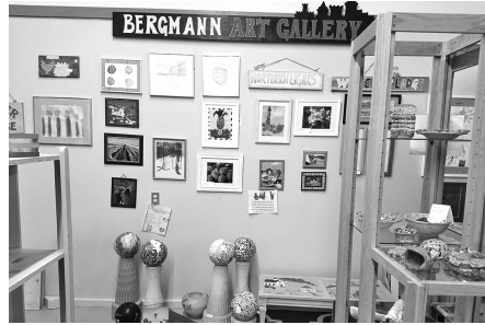
The Bergmann Center Resale Shop is located at 8888 Ance Road in Charlevoix, and is open Monday through Saturday from 9 am to 4 pm. The Shop offers terrific bargains on resale goods such as clothing, shoes, accessories, household goods, home decor and furniture. The Shop also has a fascinating art area with photos, paintings, clay sculpture, love lights made with clear stained glass with candles and painted furniture... all created by talented, artistic Bergmann Center clients.

In addition to a lot of great merchandise, the Bergmann Center Resale Shop also of-