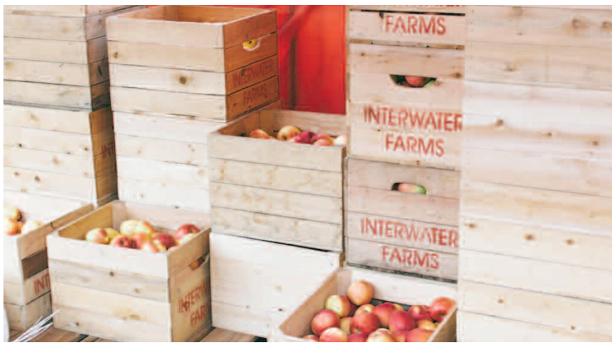
More than 30 types of apples will be available as well as other fall harvest items and baked goods, all at the 39th Annual Apple Fest taking place in downtown Charlevoix on October 13-15.