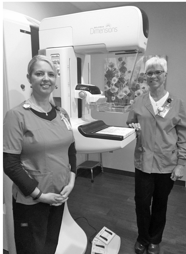
The McLaren Northern Michigan Foundation helped provide funds to purchase two new digital mammography machines this year, thanks in part to generous contributions from donors to their Breast Health Funds. October is National Breast Cancer Awareness Month, and businesses and individuals can support breast health in our community by getting involved with the Foundation.